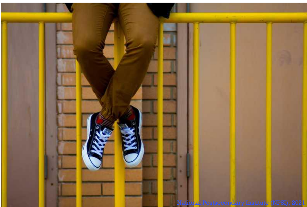
National Postsecondary Institute (NPSI), 2021

On March 5, 2021, the National Postsecondary Institute (NPSI) and Reach Higher announced the winners of the first-ever Power of Hope Award. This award is designed to recognize school districts that have counselors that engage in leadership roles to implement strategies for college and career success.